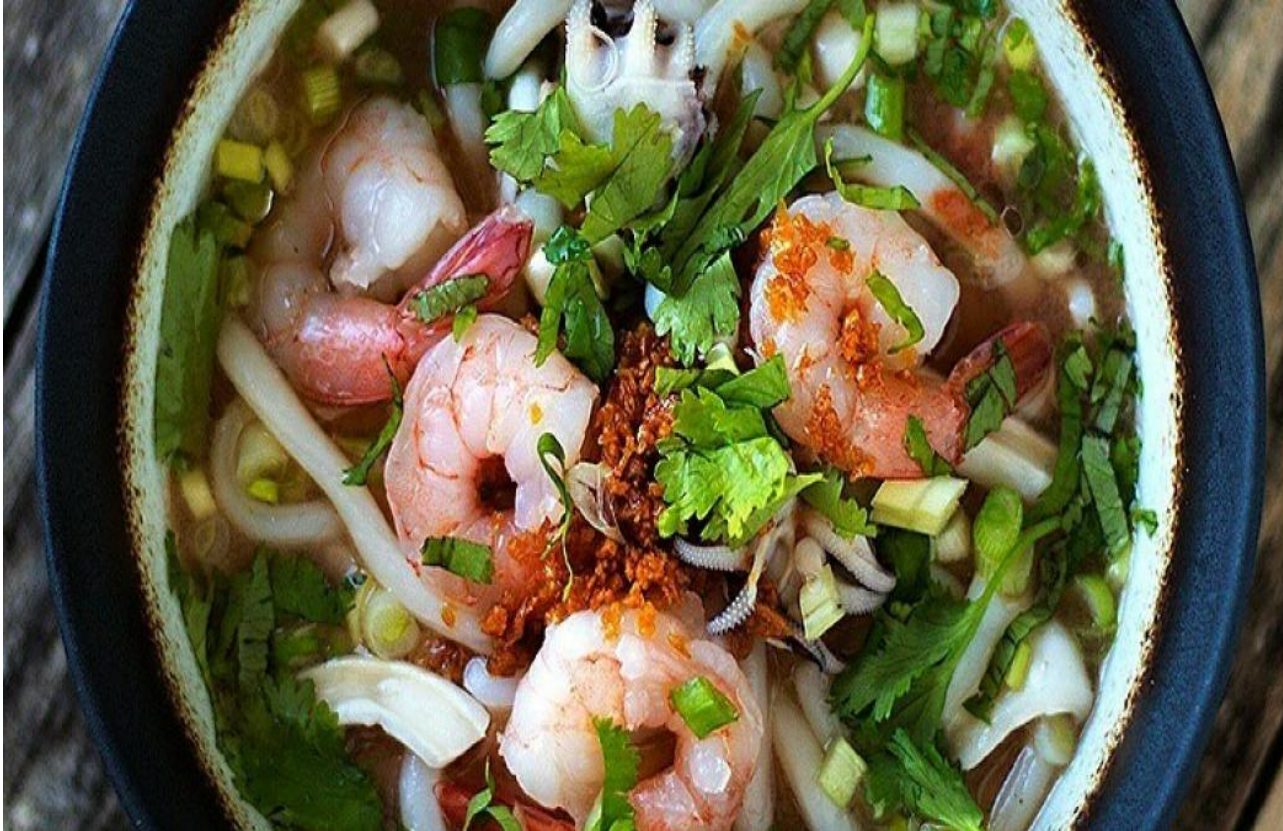
A healthy, fast and stylish spot in the Kaunas Bus Station is a safe haven for all tom yum lovers. The wok is never resting, too!